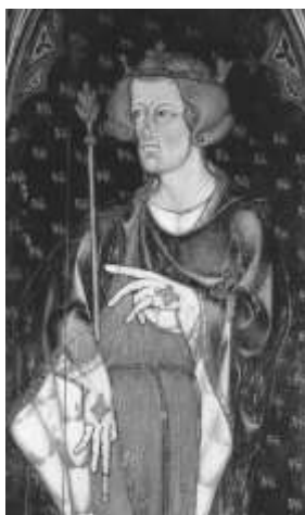
Edward I

The ships 'of Portlemouth' – be they from the east or west of the 'port's mouth' or from the estuary as a whole – were summoned by royal writ on at least eight occasions during the fourteenth century to help fight the King's enemies in Scotland and France.