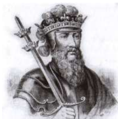
Edward III (from Cassell's History of England 1902)

In June 1328, Edward III, one year into his reign and under the domination of his mother and her lover Mortimer, issued a decree from Evesham ordering all ships over 40 tons burthen to be brought back to their ports. The mayors, bailiffs and communities of the ports, including Portlemue , were required to provide these ships with men and victuals, arms and other necessaries and to be ready to provide a defence against 'malefactors assembled on the coasts of Normandy and Poitou to aggrieve and rob merchants and other subjects of the king.' 28 Ten years later, in 1338, Edward III, now firmly secure on his throne, issued a proclamation to the bailiffs of ports, including Portlemue , which was aimed at stamping out acts of piracy against foreign merchants