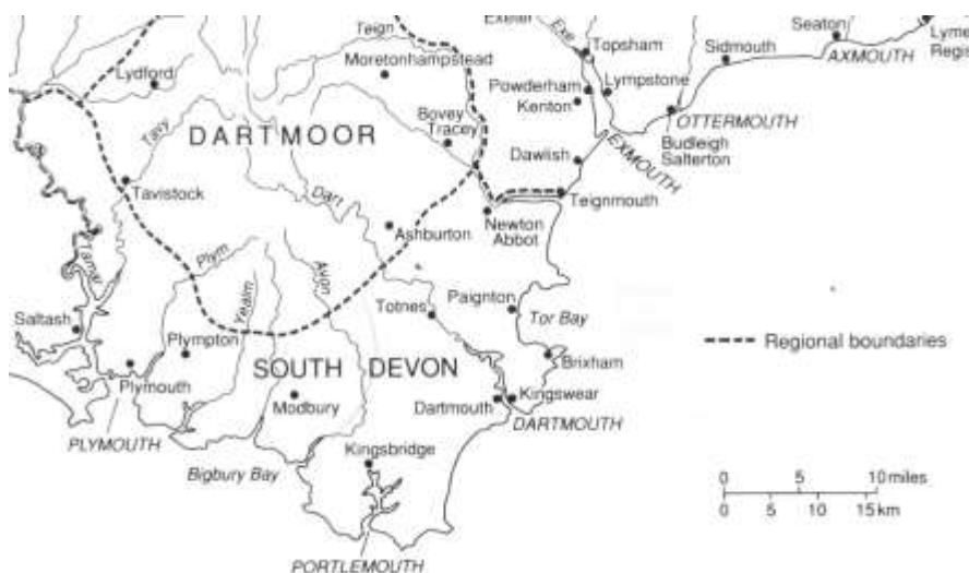
Medieval Devon. Extract from a map in Vol. 1 of 'The New Maritime History of Devon'. The caption reads: 'The names of river mouths shown in capital letters are those often used for groups of ports in the customs records'

A further possible explanation is that Portlemouth was a generic name for all the ports and harbours in the Kingsbridge Estuary. In the New Maritime History of Devon, Volume One , it is stated that the names of river mouths were often used for groups of ports in medieval customs records. 8 Indeed nearly all the ports in South Devon bore the suffix -mouth e.g. Axmouth, Ottermouth, Exmouth, Teignmouth, Dartmouth, Portlemouth and, of course, Plymouth.